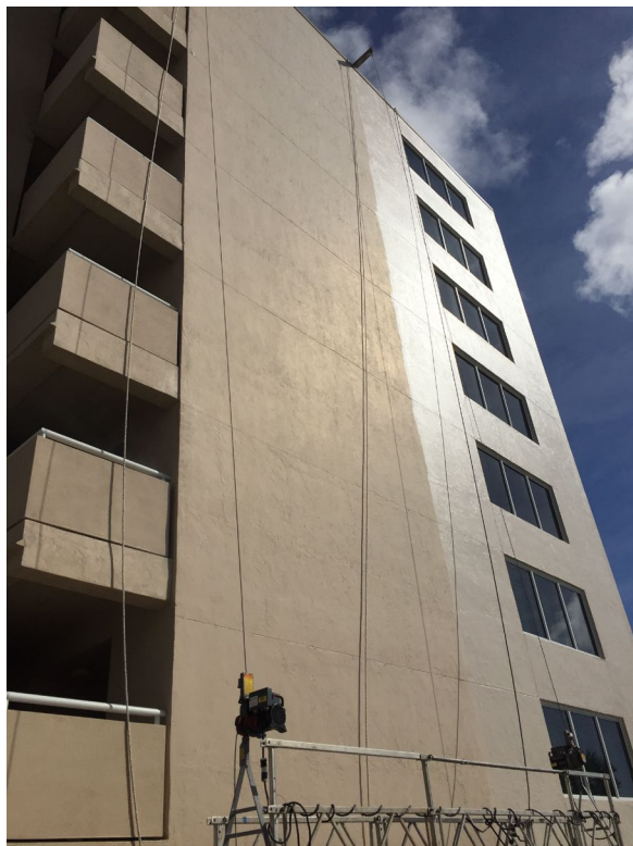
Picture 1: Swing stage moved to the West half of the South elevation wall